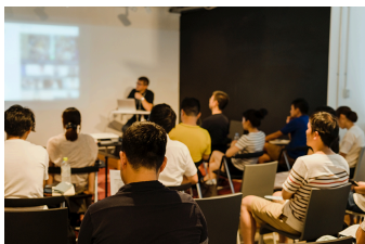
MLK Workshop Sponsor $1750