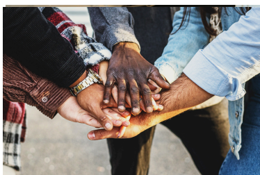
MLK Community Partner Sponsor