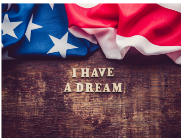
Funding the Dream Sponsor $1000