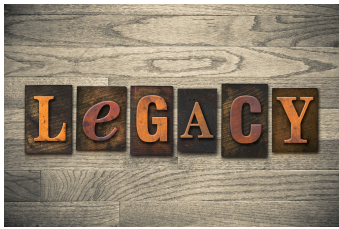
Title Sponsor $10,000