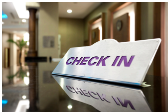
Event Check-In Sponsor $2000