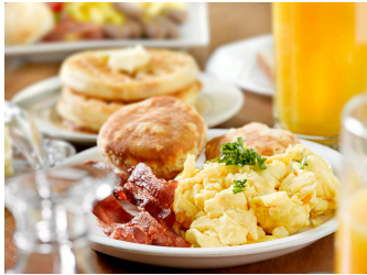
Breakfast Sponsor $5000